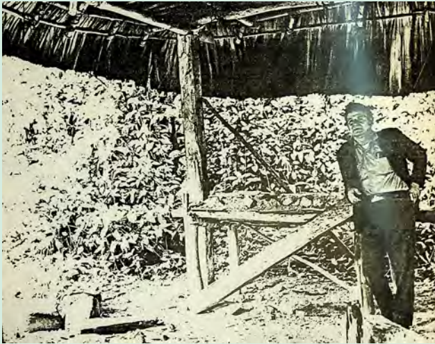
1970: The Peten of Guatemala