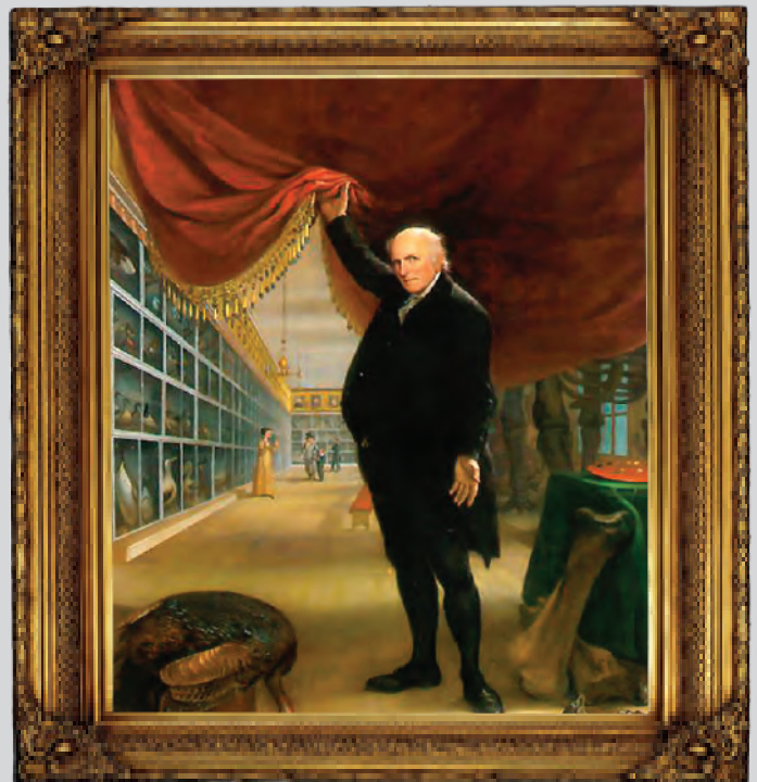
Charles Willson Peale Portrait at his “Cabinet”