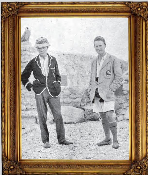
Sir Charles Leonard Woolley (left)

Museums continue to display and educate visitors on the historical and/or scientific relevance artifacts hold. In particular, the Heritage of the Americas Museum’s mission is to “To educate and to promote respect and appreciation for the early cultural heritage of the Americas and natural history of the world.” We continue to strive to uphold our mission to its fullest.